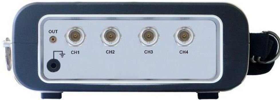
■ Figure 1 CoCo-80 with 4 BNC input connectors and an output source channel. (2 input channels can be disabled in software to reduce the purchasing cost).