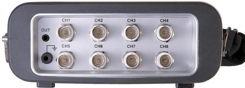
■ Figure 2 CoCo-80 with 8 BNC input connectors and an output source channel.