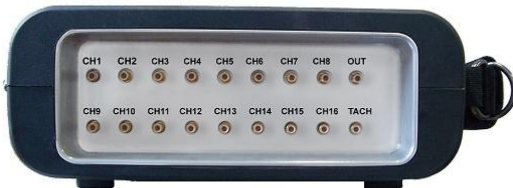
■ Figure 3 CoCo-90 with 16 SMB input connectors plus a tachometer and output source channel.